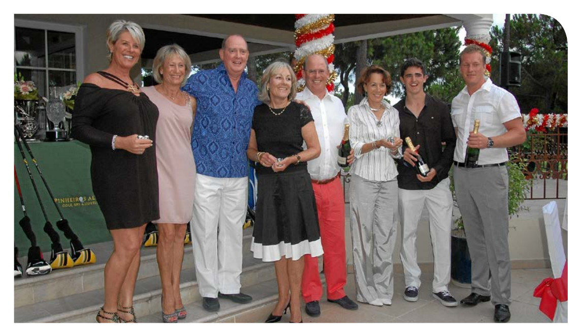
Nearest the Pin winners