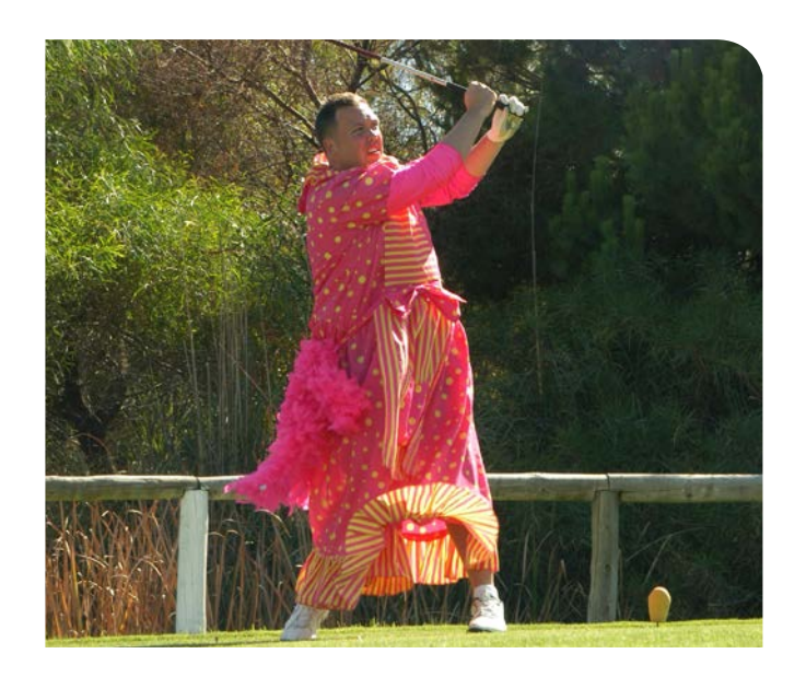
Anastasia Tremaine swing