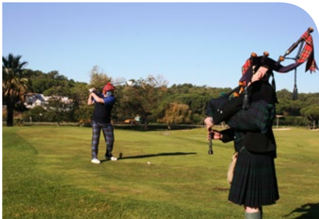
The Captain teeing off