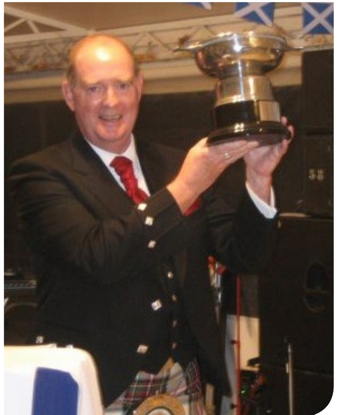
The Captain of the Celts receives the trophy

The Clubhouse has now been decorated in preparation for the end of year festivities and sign-up sheets for the various functions are available at reception.